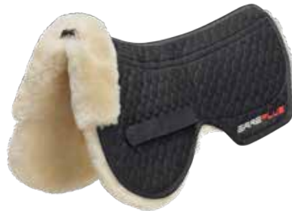
Sheepskin halfpad / code: M: 4010_2R L: 4030_2R