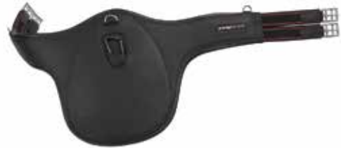
Stud girth / code: GJA