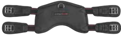
Spider / code: GDB