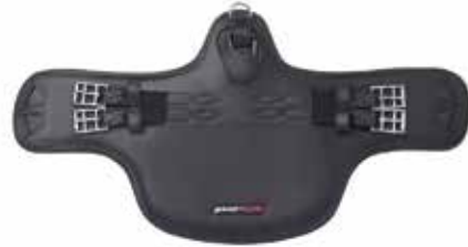
Eventing / code: GEA