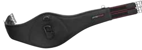
Narrow belly Jumping / code: GJB